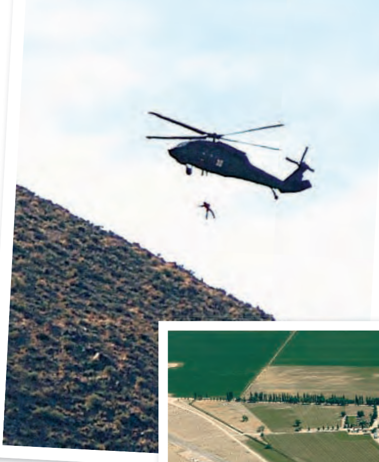
■ A Black Hawk, above, hoists a searcher investigating debris. In looking for Fossett, searchers came across six other crash sites, one of which had never been marked. The Hilton ranch's private airstrip, right, from which Fossett took off.